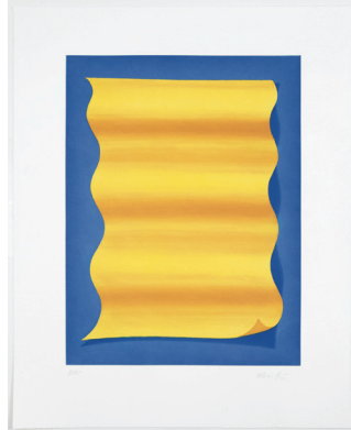
An Honor and A Privilege, 2017 (1 from a set of 7) four plate aquatint etchings with spit bite, 21.5 x 17 in, edition of 15