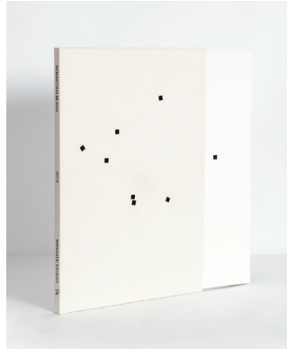
Period Piece Simple Sequence 2014 (first volume) two plate aquatint etchings in cloth bound screen printed slip case, 20 x 14 in, editions of 7