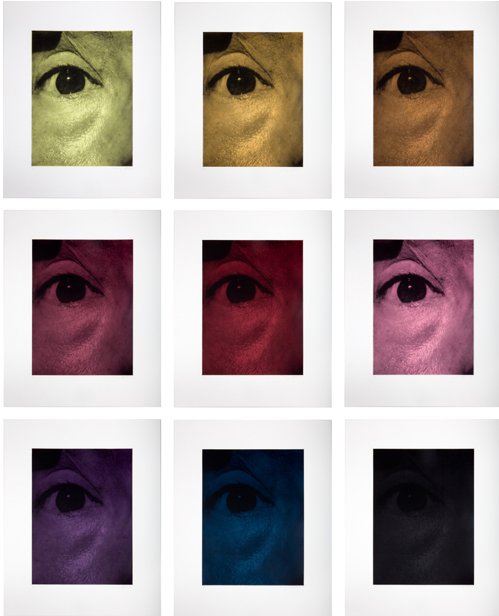
Eye Test (set of 9), 2018

photogravure and color chine collé plate size 14 x 11 inches, paper size 20.75 x 16.875 inches edition of 3