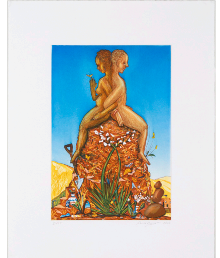
Earthy , 2023, three plate aquatint etching with soft ground on white Rives BFK paper, signed, dated and numbered by the artist on recto, plate size: 13 x 9 inches, paper size: 19.75 x 15.25 inches, edition of 25 + 3 AP's + 3 PP's, printed and published by Wingate Studio