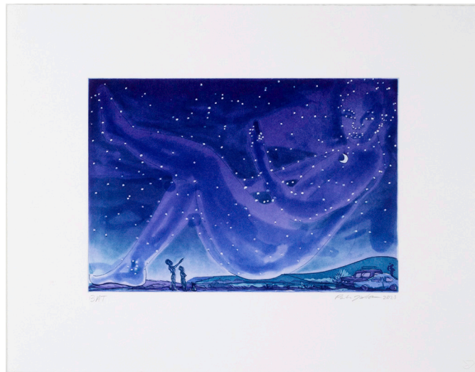
Starlight , 2023, three plate aquatint etching with soft ground on white Rives BFK paper, signed, dated and numbered by the artist on recto, plate size: 13 x 9 inches, paper size: 19.75 x 15.25 inches, edition of 25 + 3 AP's + 3 PP's, printed and published by Wingate Studio