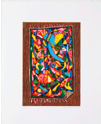
Entwined , 2023, three plate aquatint etching with soft ground on white Rives BFK paper, signed, dated and numbered by the artist on recto, plate size: 13 x 9 inches, paper size: 19.75 x 15.25 inches, edition of 25 + 3 AP's + 3 PP's, printed and published by Wingate Studio