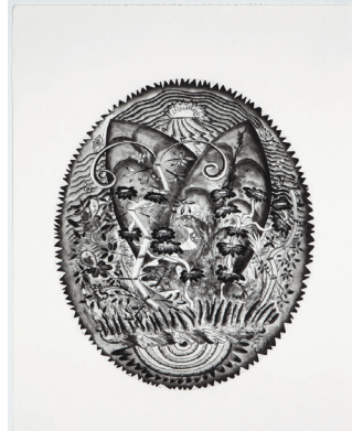
South Parish, 2017 (1 from a series of 6) single plate aquatint etchings with burnishing, dry point, electric engraving, hard ground and soft ground 30.5 x 22 in editions of 20