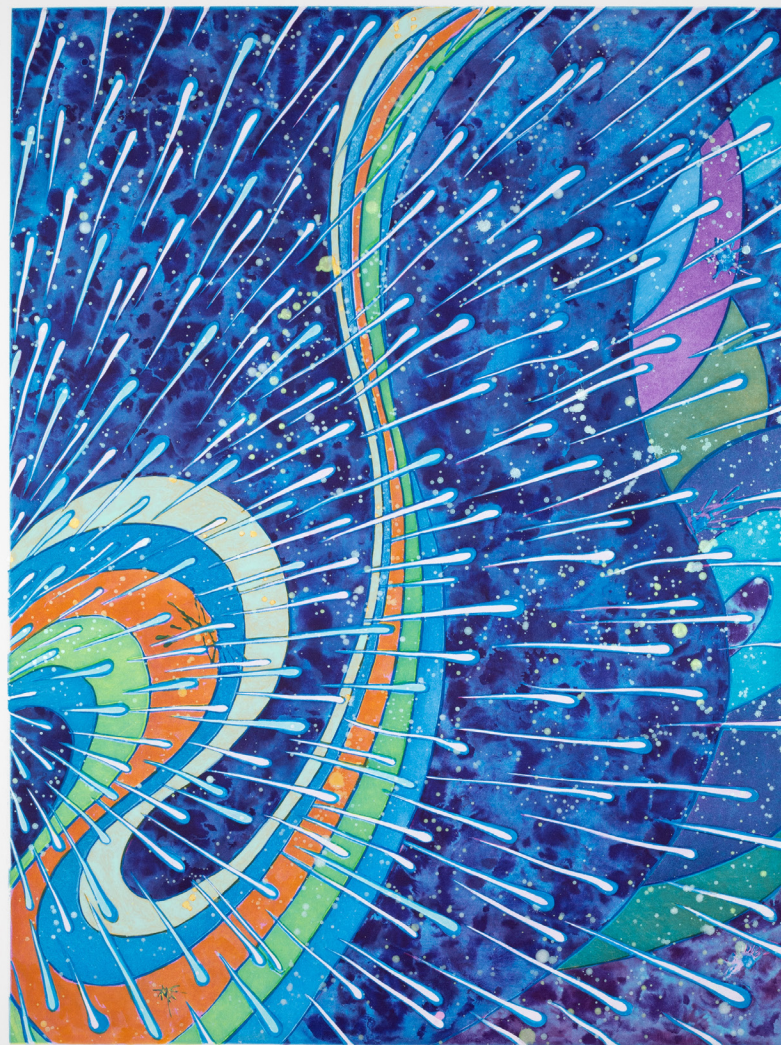
Barbara Takenaga, Swoop III , 2026 Four plate aquatint etching with soap ground, spite bite, sugar lift and hand painting Plate size: 18 x 24 inches Paper size: 24.875 x 32 inches Unique Printed and published by Wingate Studio