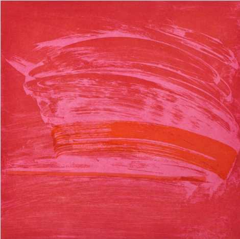
Wingate Sanguine, 2015 soap ground, sugar lift, aquatint plate 10 x 10 inches, sheet 18 x 19 inches edition of 30 published by Wingate Studio