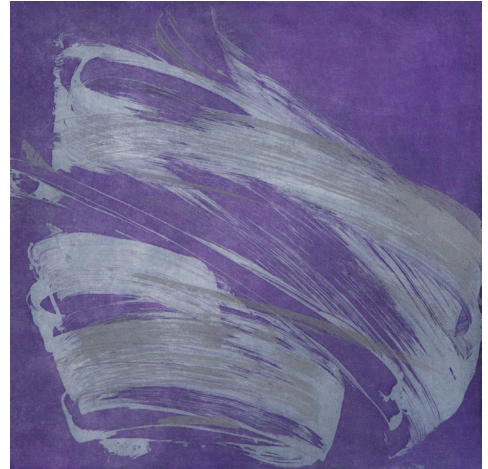
Wingate Violet, 2015 soap ground, sugar lift, aquatint plate 10 x 10 inches, sheet 18 x 19 inches edition of 30 published by Wingate Studio

Wingate Studio is pleased to present three color etchings by Jill Moser. The prints were created over the course of five days at Wingate Studio in early March 2015.